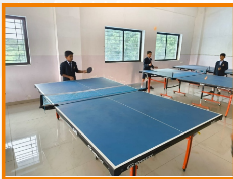
Table Tensions Court